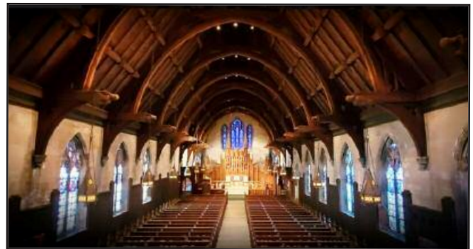
Saint Paul's Episcopal Church, Chestnut Hill

https://www.youtube.com/watch?v=oMit8NpgTYM